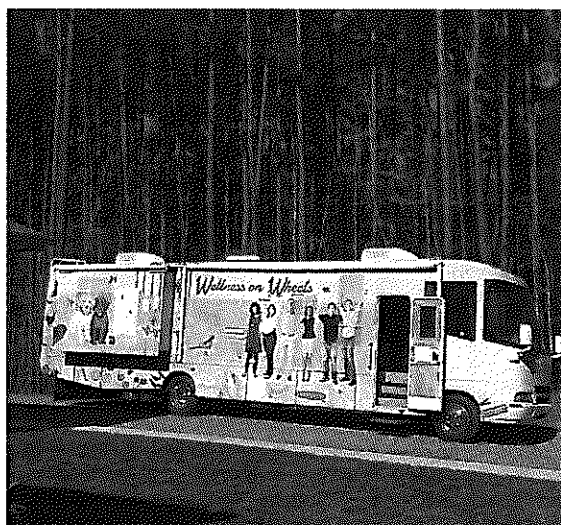
The "Wellness on Wheels" van was funded in part by Chapel in the Pines and continues to provide mobile health care