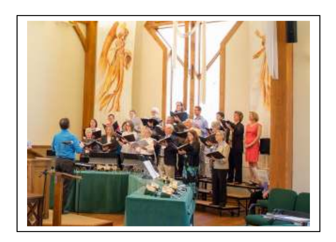
Bell Choir Choir