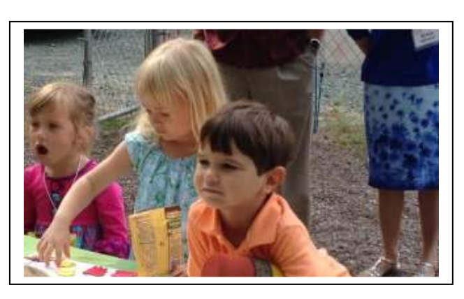
Sunday School Kick-Off, August 2015